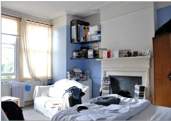
Front Reception Room (used as a bedroom)