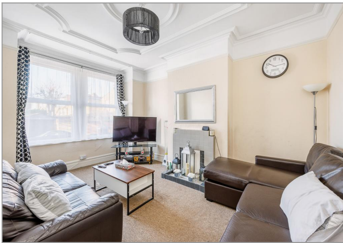
Front Reception Room