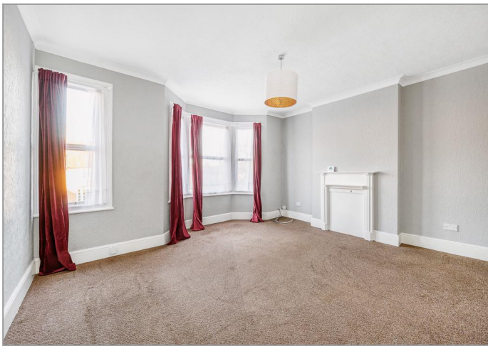
Generous Living/Dining Room