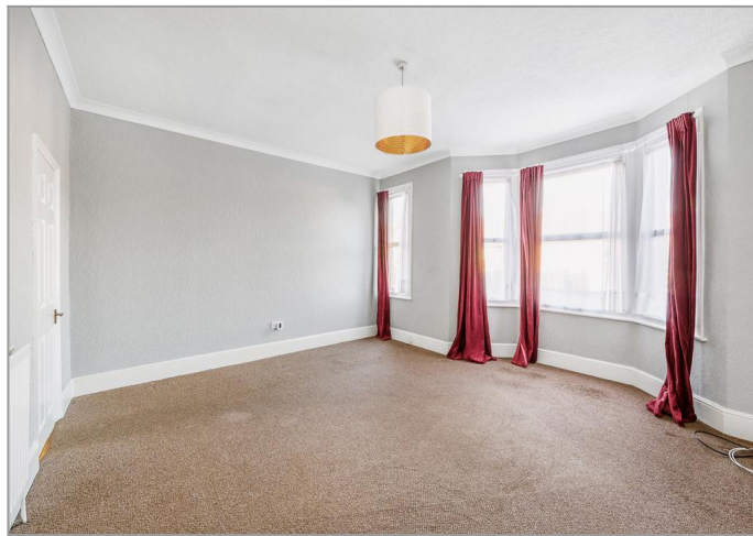
Living/Dining Room - Alternative View