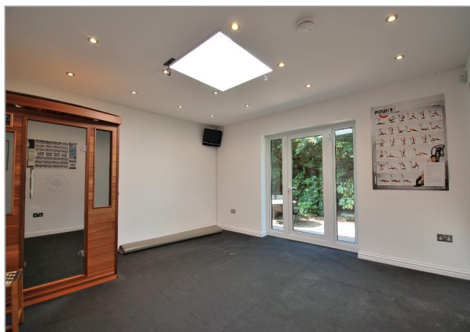
Gym & Sauna