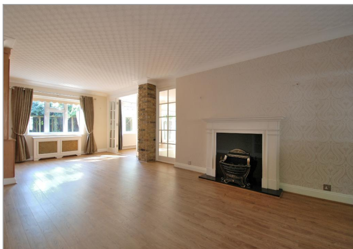
Through Reception Rooms