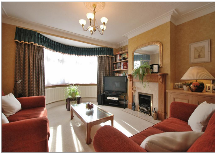
Front Reception Room