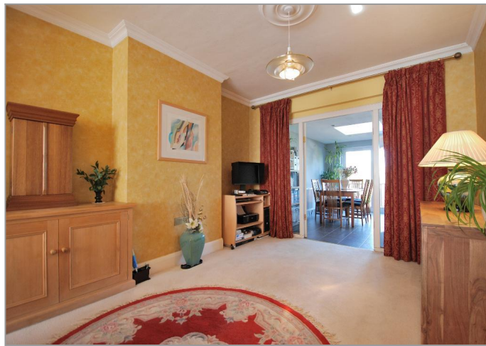
Rear Reception Room