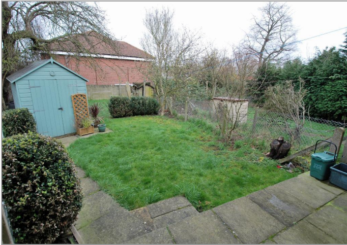
Own Rear Garden