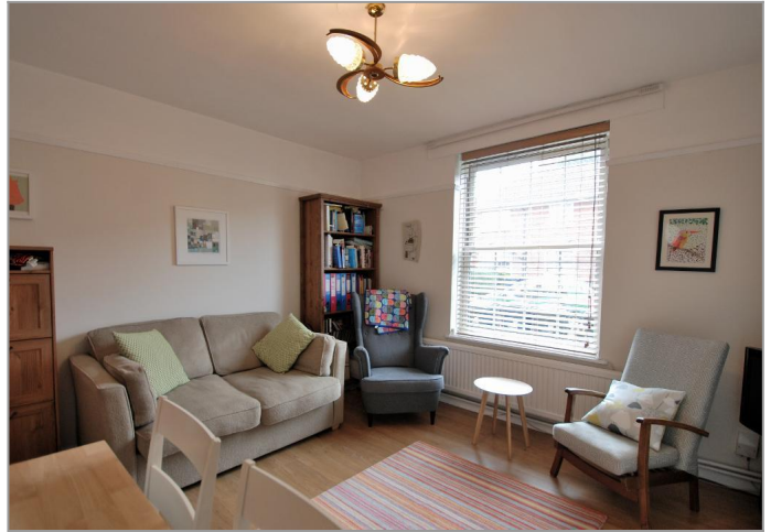
Living/Dining - Alternative View