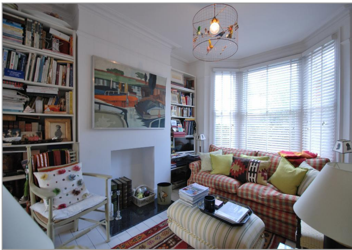
Front Reception Room