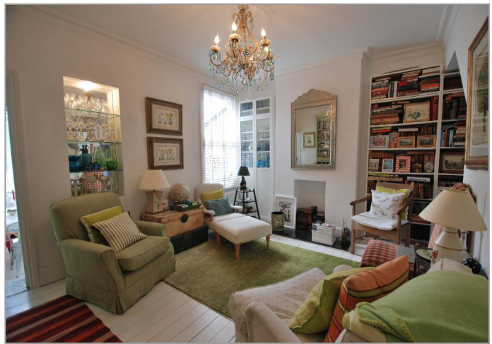
Rear Reception Room