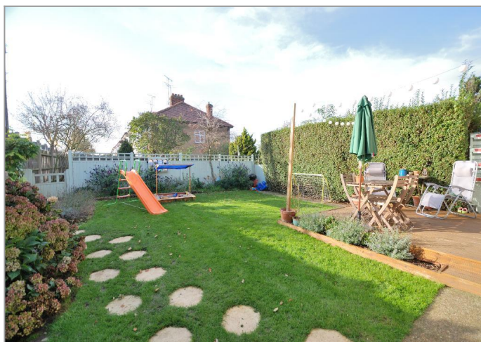
Generous Westerly Facing Garden