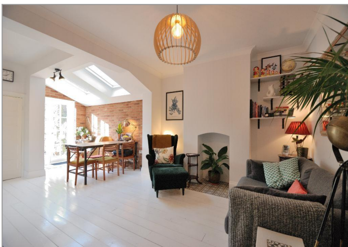
Superb Open-Plan Living/Dining Areas