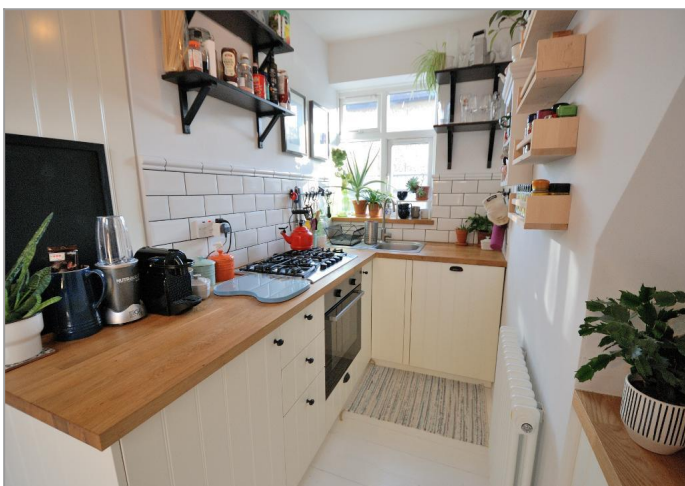
Modern Fitted Kitchen Area