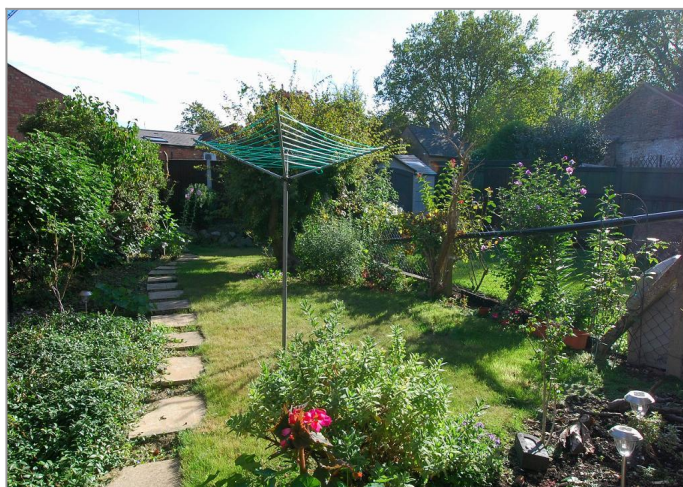
Delightful Own Rear Garden