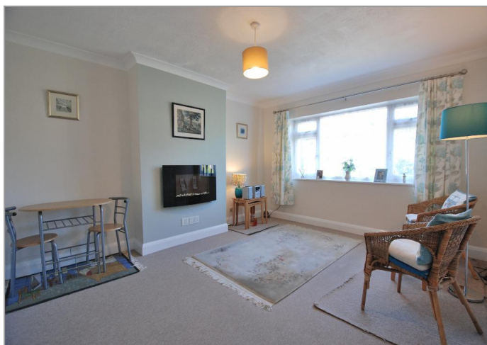
Generous Living/Dining Room