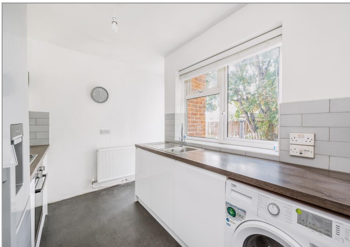
Superb, Fitted Kitchen