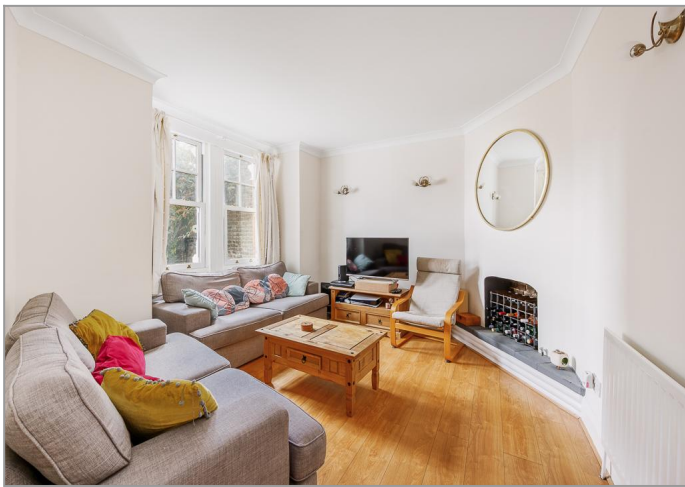
Generous Reception Room