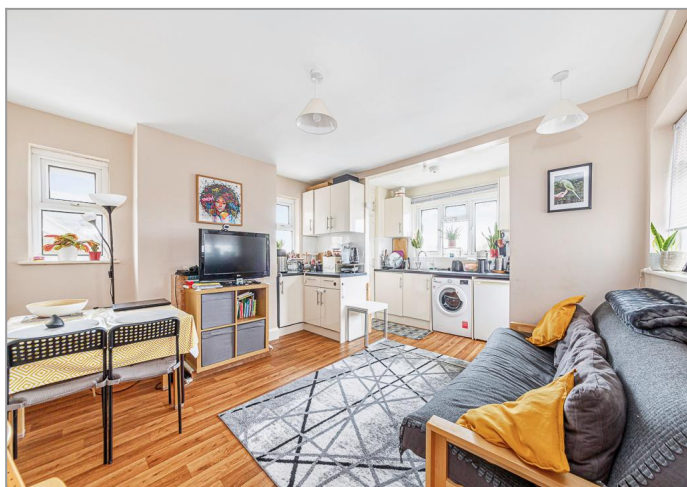
Contemporary Open-Plan Living Spaces