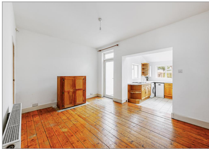
Rear Reception Room