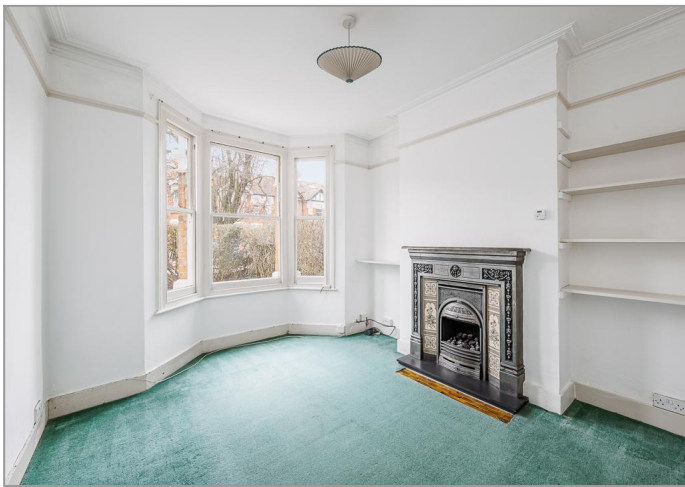
Front Reception Room